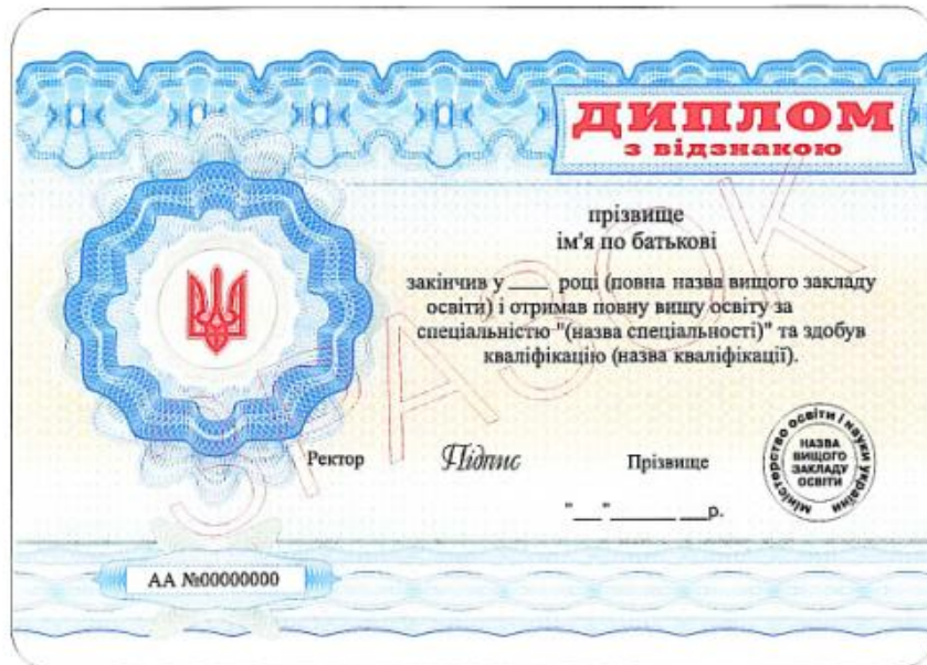
Sample document 13: Specialist Degree "with Honours."