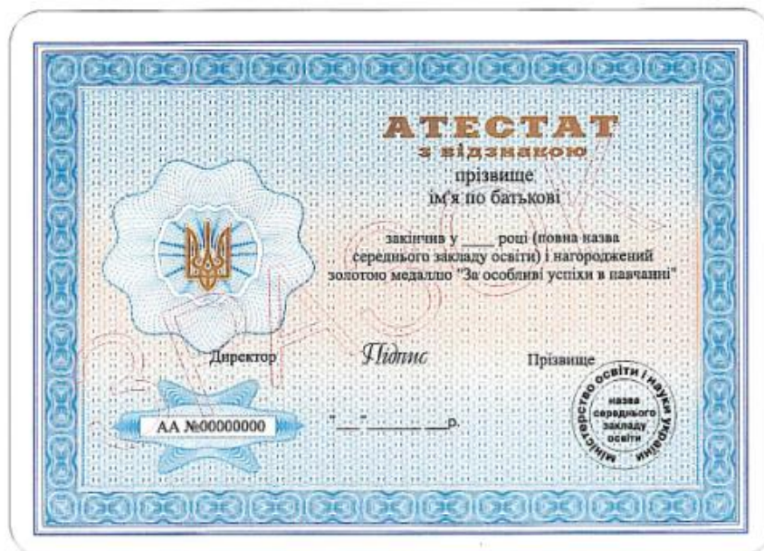
Sample document 5: Certificate of Complete General Secondary Education – “Gold Medal.”