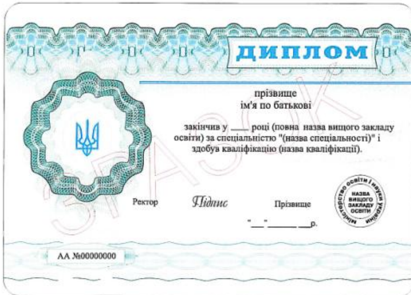
Sample document 8: Diploma of Junior Specialist.