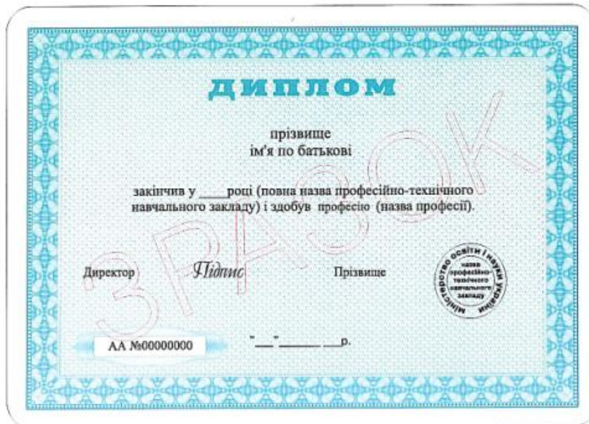
Sample document 6: Diploma of Qualified Worker.