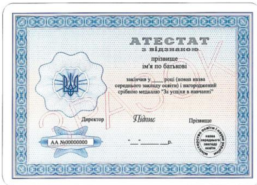
Sample document 4: Certificate of Complete General Secondary Education – “Silver Medal.”