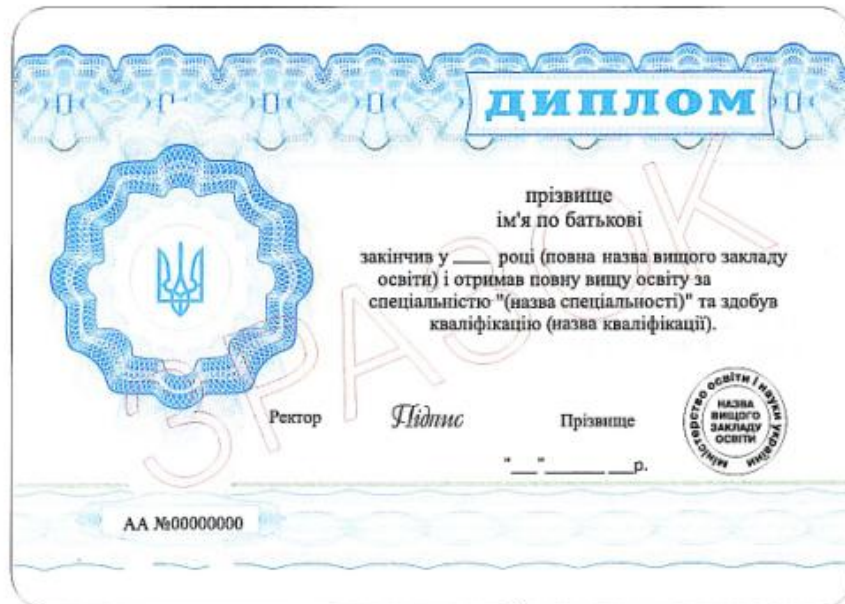
Sample document 12: Specialist Degree