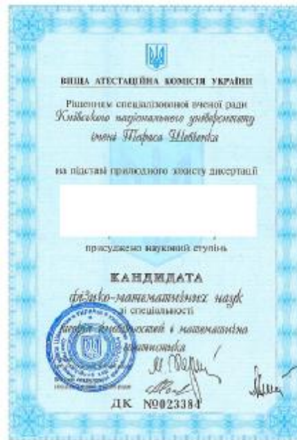
Sample document 16: Degree of Candidate of Sciences