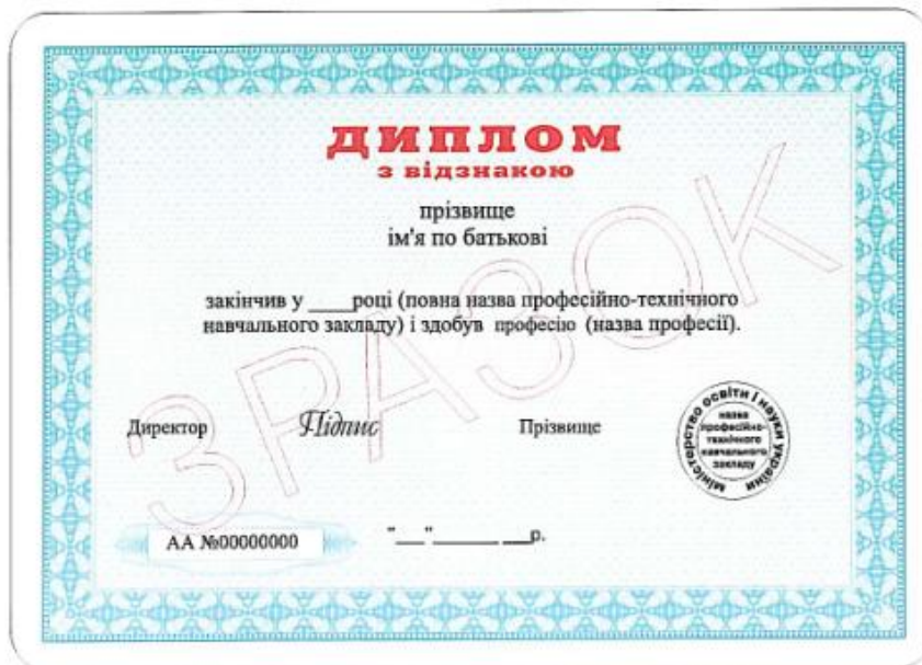
Sample document 7: Diploma of Qualified Worker "with Honours."