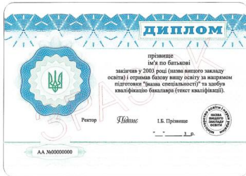
Sample document 10: Degree of Bachelor