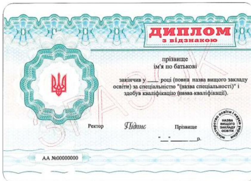
Sample document 9: Diploma of Junior Specialist "with Honours."