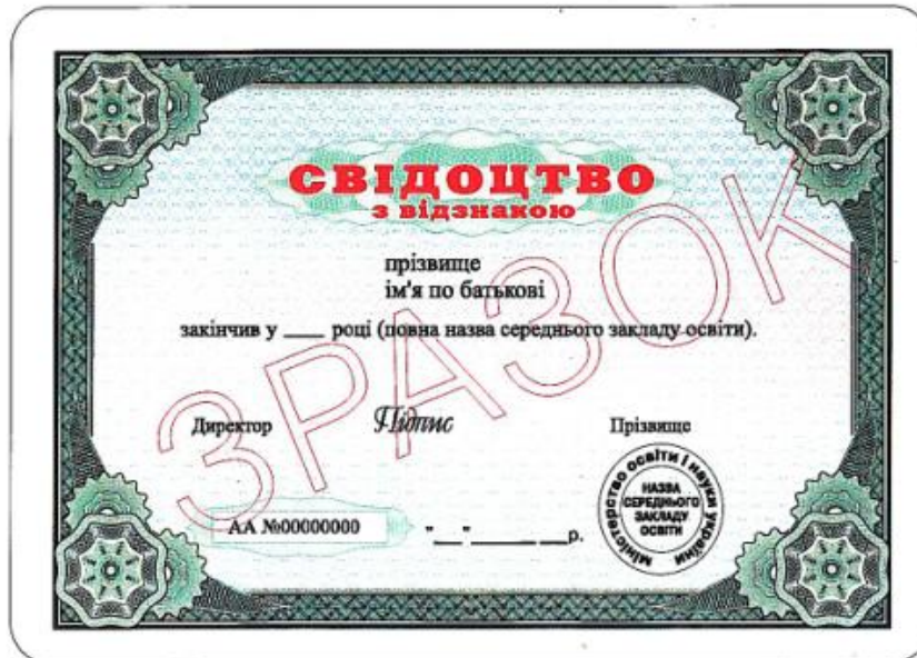
Sample document 2: Certificate of Basic General Secondary Education “with Honours”.