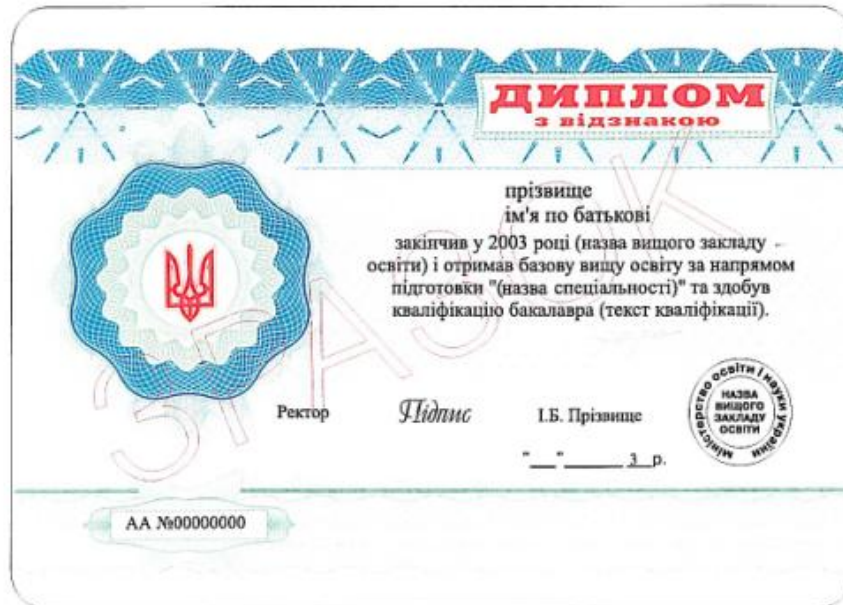
Sample document 11: Degree of Bachelor "with Honours."