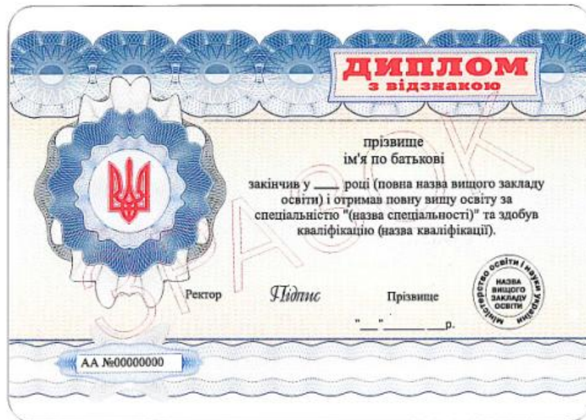
Sample document 15: Degree of Master "with Honours."