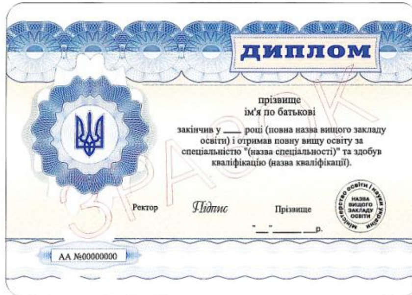
Sample document 14: Degree of Master