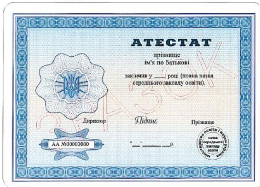
Sample document 3: Certificate of Complete General Secondary Education.