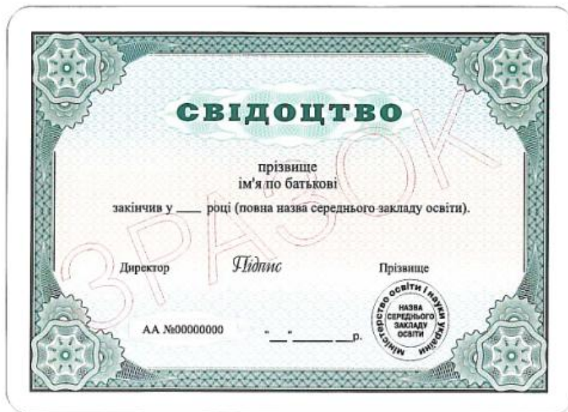
Sample document 1: Certificate of Basic General Secondary Education.